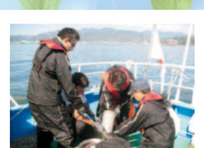
Testing substances in the middle of the sea