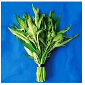
water morning glory ( lpomoea aquatica )