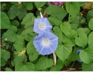
noasagao ( Ipomoea indica )