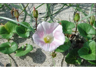
sea bells ( Calystegia soldanella )